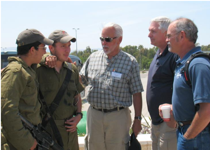
Tour members thank and encourage soldiers from Galilee.

In all the wars and conflicts Israel has had, the soldiers are the ones who have become most hated and despised by the world. Israel, with population of about 7.0 million people (including all minority groups), is surrounded by over 400 million increasingly hostile Muslim Arabs, Turks and others. The recent uprising in neighboring countries, such as Jordan, Syria, Lebanon and Egypt, has encouraged renewed violence against Israelis, as the Itamar killing of a family and the Jerusalem bus bombing in March 2011 have proved. A number of Muslim terror groups, operating in and around Israel, openly incite people of those nations to attack Israel, especially the soldiers. Keeping the homeland safe is a challenge. These young men and women risk their lives daily as they patrol the border areas, check IDs at road blocks, hunt down terror suspects or fight in conflicts and wars.