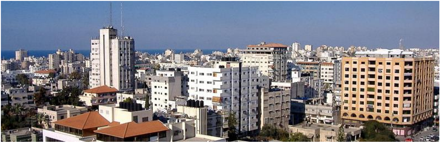
A view of the modern and prosperous Gaza City.