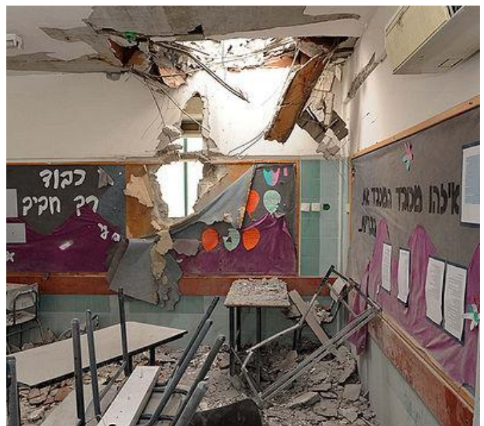
Preceding Israel’s Operation Cast Lead to Gaza in winter 2008–2009, Palestinians had fired over 10,000 rockets from civilian areas in Gaza into southern Israel. Photo: Beersheba kindergarten after one of the Palestinian rocket attacks from Gaza.

Prime Minister Benjamin Netanyahu has instructed various ministries to formulate practical and public diplomacy measures, in order to cancel the Goldstone report and minimize the great damage that has been done by this campaign of denigration against the State of Israel.