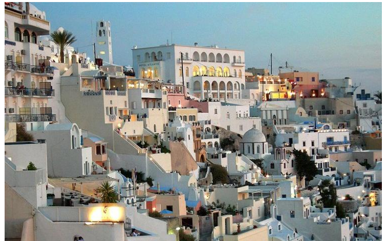
African Congo (a school classroom) and Mediterranean Greece (sunset on Santorini) represent renewed and closer ties with Israel.

We praise the Lord that among the world nations He has preserved a few who may come to Israel's aid.