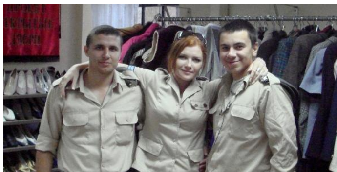
Your shipments also bless soldiers in the most practical ways

In the U.S., H.E.L.P. International is the designated clothing coordinator, and they have permission to bring clothing shipments to Israel. Therefore, send your packages directly to Loveland, CO. Do not ship or mail packages to CFI-USA in North Carolina. We thank you for your help.