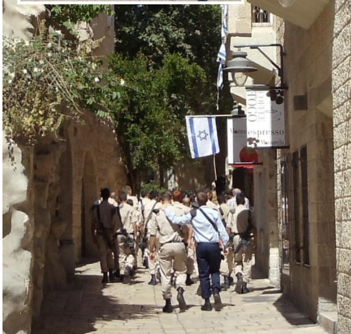
Walking the paths of the Promised Land...