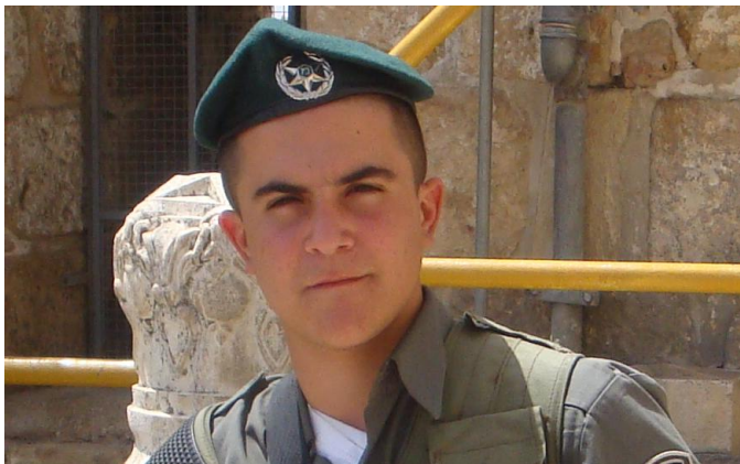
A border policeman in problem-prone Hebron.

As it is often in any business, personal contacts and co-operation with other organizations are the keys for good results. Our Board Members make a point to visit the final recipients of our support. Also, we include in each of our tours meetings with IDF soldiers, leaders of Jewish communities, Holocaust survivors, terror victims and others. It is a joy to witness how your gifts have helped to provide the needs each of these groups have. We appreciate you and sincerely thank you for your giving. Until Chanukah (December 2-9) we raise funds for the soldiers. Please remember that just $25 buys a warm, Israeli-made fleece jacket for a young soldier.