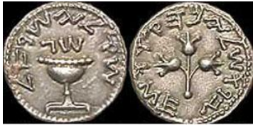
Silver Shekel (Year 4 A.D.) "Shekel Israel" (left), reverse "Jerusalem Holy."