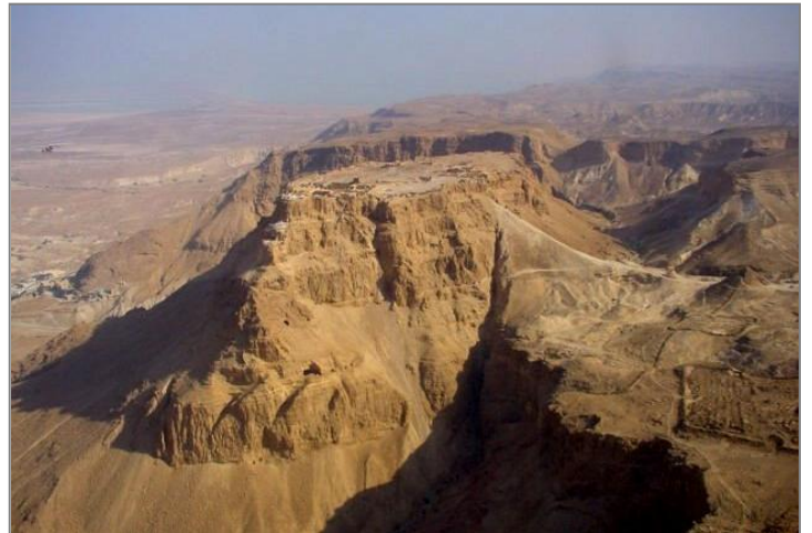
Herod's Dead Sea fortress, Masada, fell in 73 A.D.

Contact 704.552.1283 or cfiusa@cfi-usa.org for full details.