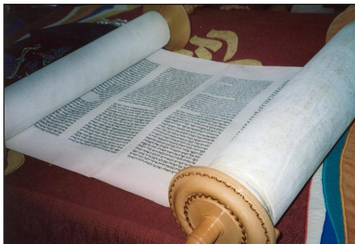
A scroll of Hebrew Scriptures in a synagogue.