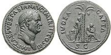
Silver "Judea Capta" coin from 70 A.D. Emperor Vespasian (left) conquered Jerusalem with his son Titus. Reverse "Judea conquered."

The ancient Jewish coin has become a powerful weapon in the "war of words" being waged against radical Islamists seeking to break, or at least deny, Israel's 3,000-year-old bond with Jerusalem. Found in desert caves and drainage ditches, buried under mounds of rubble, recovered from the bottom of the sea or sealed in centuries-old clay jars, these tiny discs of gold, silver and bronze have unequivocally confirmed classical religious and historical texts.