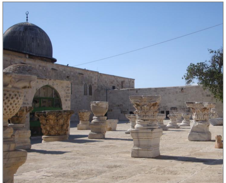
The Wakf has conducted illegal excavations under the ancient Temple platform, systematically destroying Jewish sites.