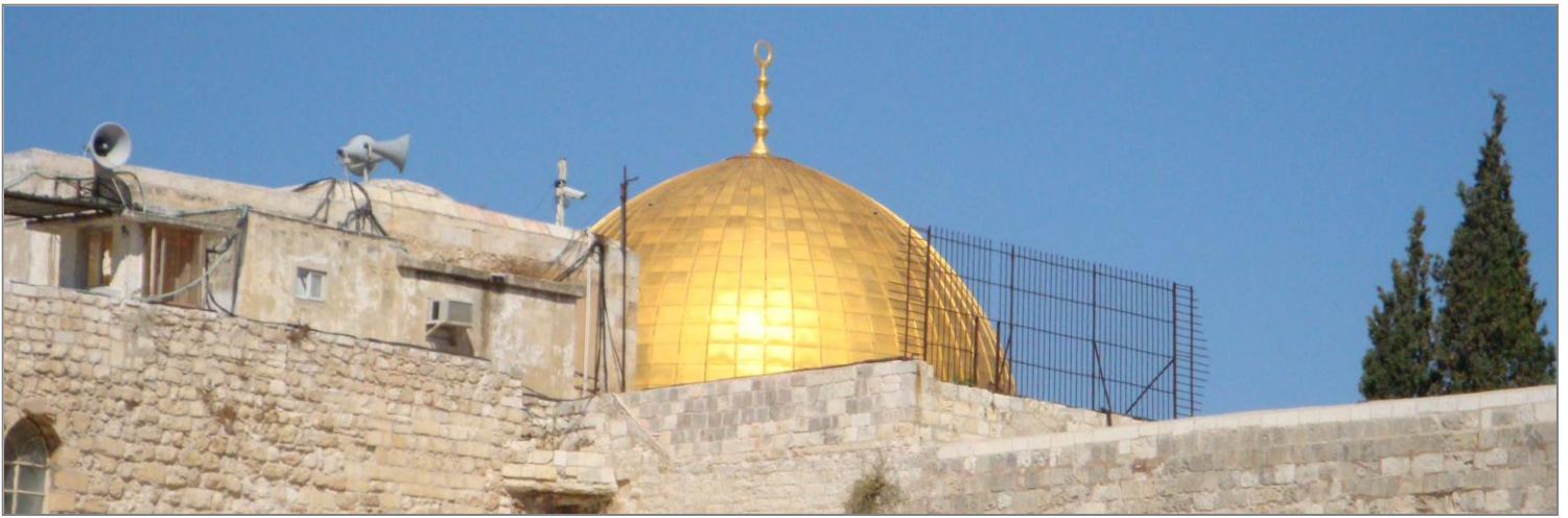
The golden dome, a symbol of the occupier on the Temple Mount.