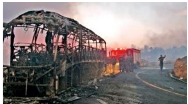
The burned bus where 40 prison guards lost their lives.

CFI-USA—together with CFI in Jerusalem—has established a relief fund to assist the victim families. Urgent appeals are coming in to help especially the families with temporary housing, household needs and other necessities. The Mt. Carmel families lost everything they had. Their disaster assistance will be an ongoing need for some time into the future. Please consider sending your gift today!