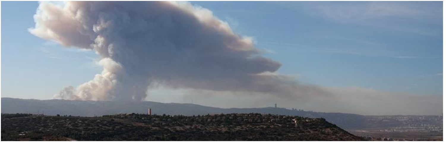
Fire starting on Mt. Carmel