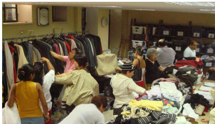
This Moriah St Distribution Center served well since the height of the Russian Jewish immigration in 1990's.

The Center in Jerusalem has been temporary closed and CFI is looking for another, even more centrally situated facility, to relocate the projects. Please wait for the move to take place before sending packages to Israel.