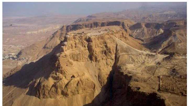
Masada mountain top where about 900 Jews committed suicide while under siege of the Roman Legion X in 72-73 A.D.